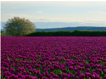
The Purple Fields

Kessel's photographs on display include: The Purple Field , a tulip field photographed in springtime in the Skagit Valley; Wild Sea , a shot of the Pacific coast off Monterey, CA, following a storm; and Inside Water , a study in abstract reflections. They are a part of the show's USA Exhibition, curated by Julienne Johnson, which includes 147 artworks and the art of 64 artists: paintings, sculptures and photography, representing a broad range of American work.